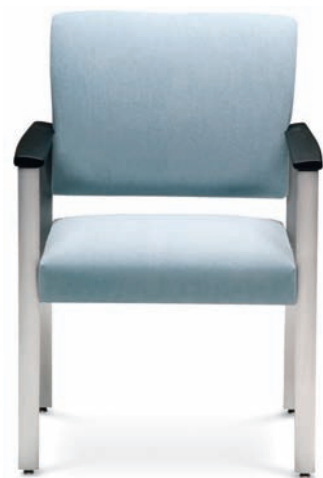
1340-PA Amenity Metal Guest Chair Shown with optional polyurethane arm caps