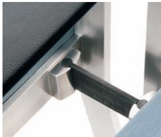
The Amenty Metal's unique ganging device allows ganged units to be reconfigured easily by maintenance personnel.