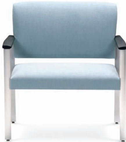
1340-K Amenity Metal Bariatric Chair 1000lbs. Shown with optional polyurethane arm caps