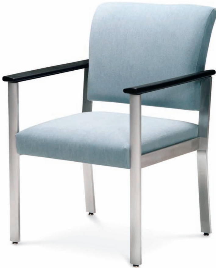
A m e n i t y M e t a l