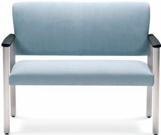
1340-2PA Amenity Metal Loveseat Shown with optional polyurethane arm caps