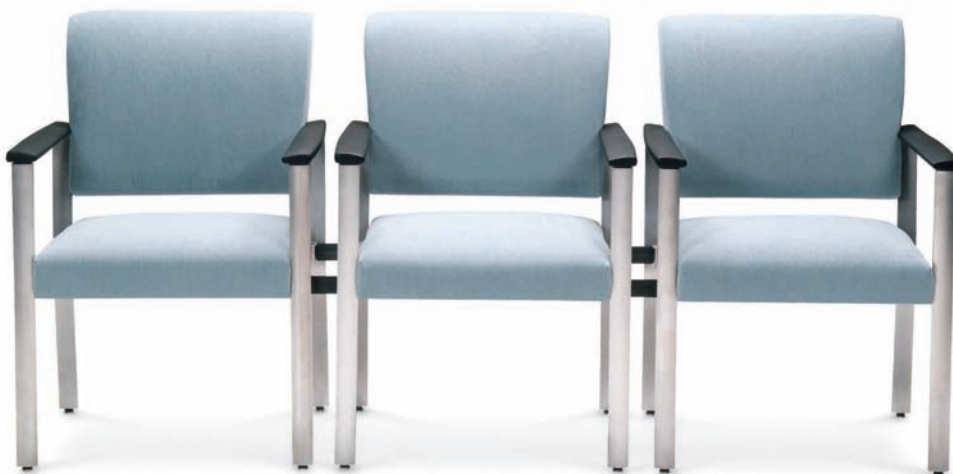
1340CCC-PA Amenty Metal Ganged Seating Shown with optional polyurethane arm caps