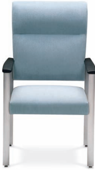
1345-PA Amenity Metal Patient Chair Shown with optional polyurethane arm caps