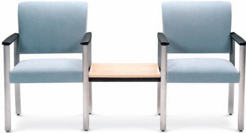
1340CMC-PA Amenty Metal Ganged Seating with Table Shown with optional polyurethane arm caps